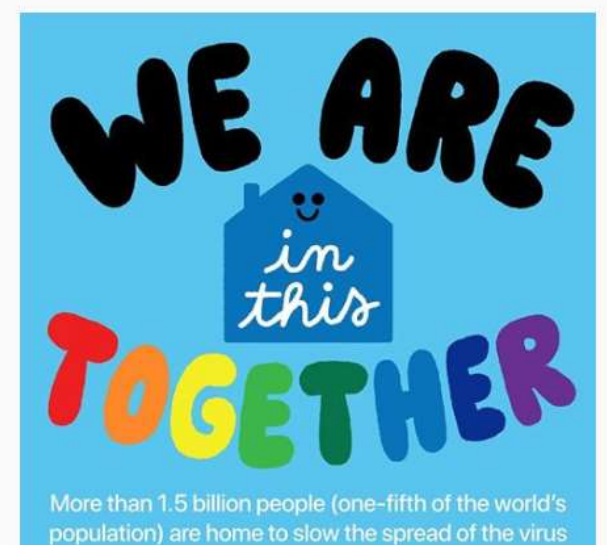
The Hoppy Broadcast

You can choose your breakout session when pre-registering. Please use this link to register: